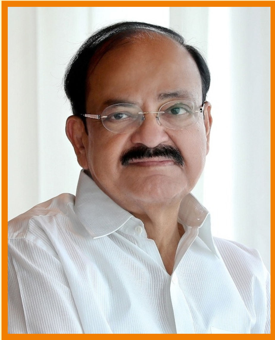
Hon'ble Shri M. Venkaiah Naidu, Vice President of India and Chancellor, Panjab University, Chandigarh