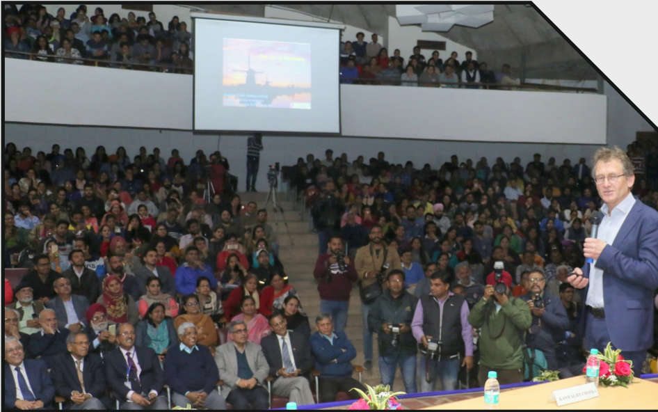
Professor Bernard Lucas Feringa, Nobel Laureate in Chemistry Raman Chair Professor, Indian Academy of Science, University of Groningen, The Netherlands giving lecture at 13th Chandigarh Science Congress during celebration of Platinum Jubilee of “Panjab University Pharmaceutical Sciences”.